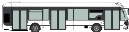
Layout 12 m

6 cylinders in line, longitudinal at the rear, Common Rail